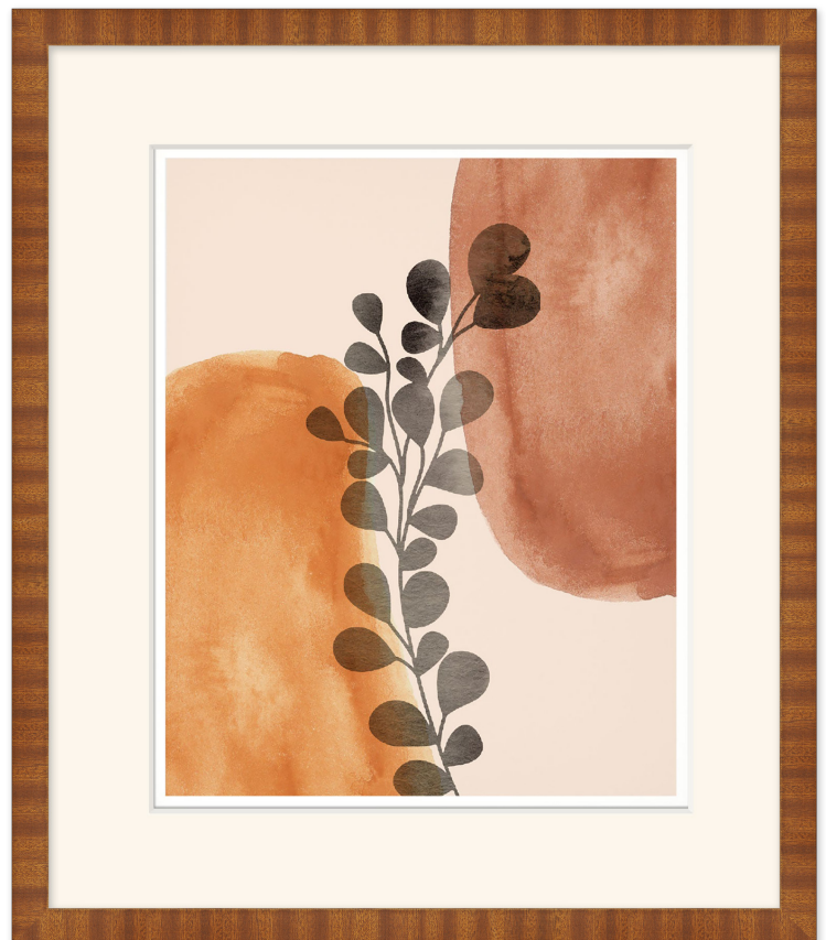
Art (right): Eucalyptus , watercolor 84378: mahogany veneer 1 3/8" height x 34" wide profile

Shizen ( SHEE-zen ) is the Japanese word for nature , which is echoed in the collection's beautiful visual features. The natural matte wood surfaces along with its sublime cross-grain finish create a harmonious pattern and rhythm surrounding the artwork. This draws the eye inward via radiating bands of contrasting hues and variegation of tones.