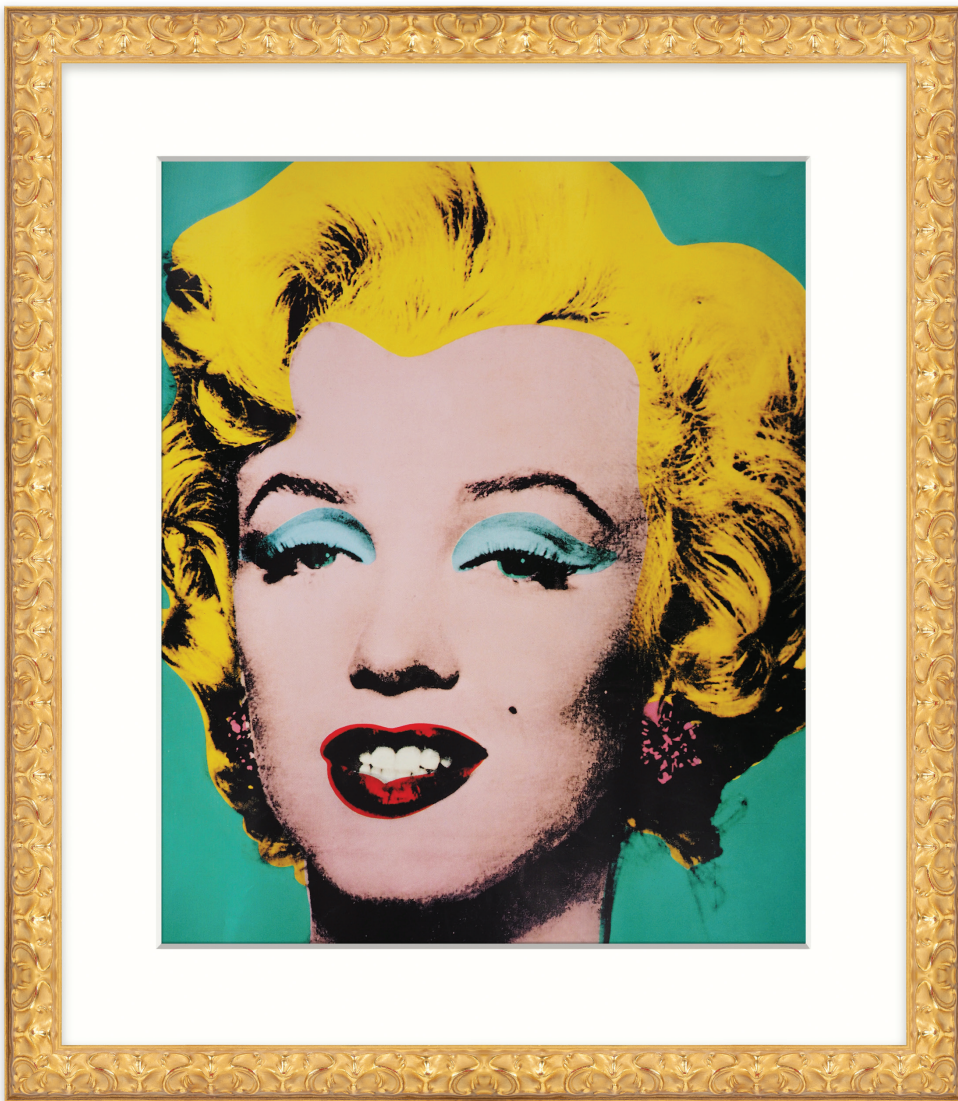
△ Art (above): Marilyn , Andy Warhol c.1962